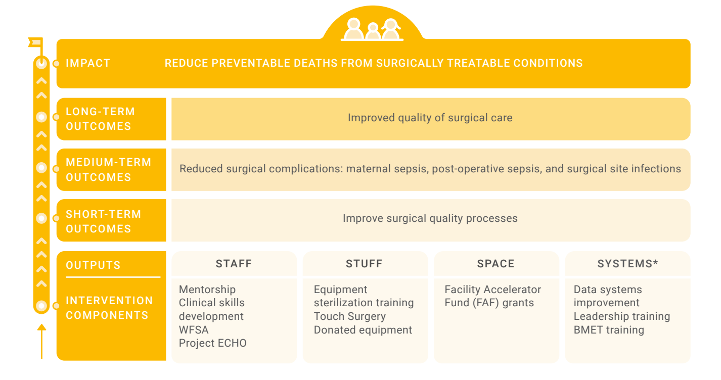
FIGURE 4: SAFE SURGERY 2020'S THEORY OF CHANGE IN TANZANIA

outcomes. These metrics have evolved over time and are calibrated to match the realities on the ground based on what can feasibly be measured in certain program timeframes, as well as what is possible under our country-specific theories of change. For example, as our Tanzania program took shape and we defined the implementation timeline, we deliberately pivoted from an initial focus on high-level impact measures to process measures that would manifest within the implementation timeframe. We recalibrated our overall theory of change, pivoting away from surgical volume as quality emerged as the core focus of our program. Our M&E work seeks to understand how our activities on the ground translate to better health outcomes.