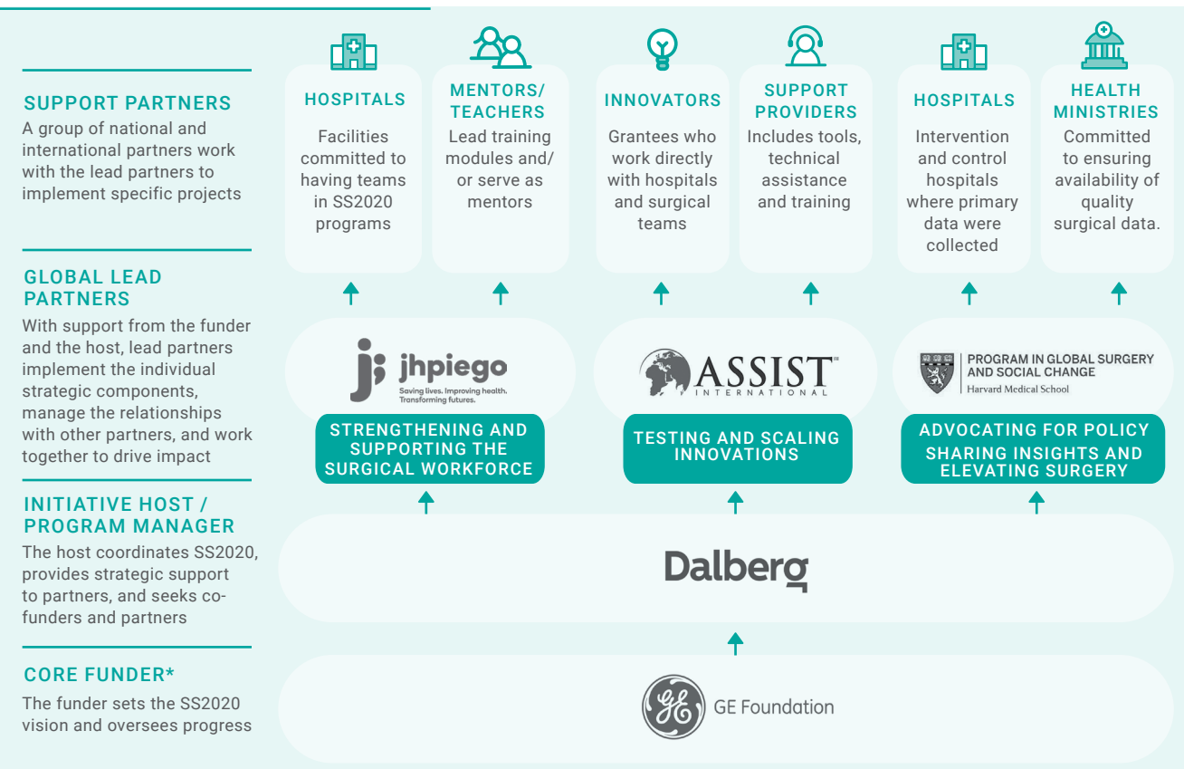
FIGURE 2: SAFE SURGERY 2020 MODEL

* Some specific programs were also co-funded by ELMA Philanthropies and Grand Challenges Canada