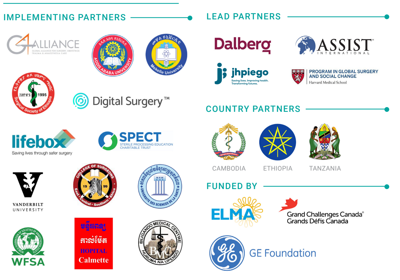
FIGURE 1: SAFE SURGERY 2020 PARTNERSHIPS

To address these critical challenges to global health, a group of partners with unique skill sets in the global health space launched the Safe Surgery 2020 (SS2020) initiative in 2015. GE Foundation committed a catalytic USD 25 million in funding. Dalberg joined to coordinate implementation across the three key partners. Jhpiego, an affiliate of Johns Hopkins, leads on strengthening and supporting surgical teams by providing technical and essential people skills training and mentorship support. Assist International drives new solutions to top-priority surgical gaps in resource-poor countries by finding and supporting innovators with funding, training, and mentorship, as well as providing much needed infrastructure upgrades and equipment donations. Harvard Medical School's Program in Global Surgery and Social Change (PGSSC) helps countries develop strategic plans to improve surgical care, and conducts evaluations of SS2020 programs to ensure impact and identification of the most effective practices.<sup>12</sup> Finally, our work is enabled by a host of local partners—health ministries, hospitals, universities, and local implementers and professional associations—who lend SS2020 their expertise and understanding of the local context.