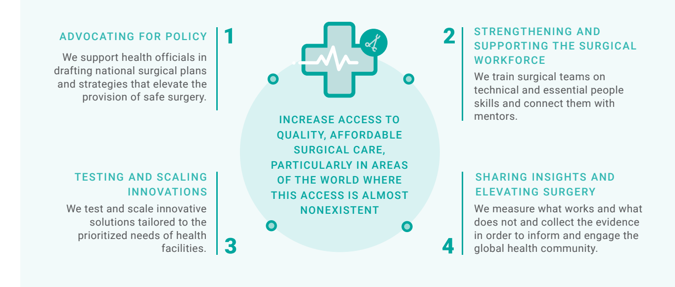
FIGURE 2.1: SAFE SURGERY 2020 MODEL

that access was not only expanded but is also more equitable. This represented a move away from traditional vertical programs which singularly focus on a narrow field of issues affecting a particular area of health. After conducting extensive research and consulting experts in healthcare, policy, and strategy, we settled on an approach that holistically addresses root causes of inadequate access to surgical care. To drive change, SS2020 focused on four key elements of our systems-change approach.